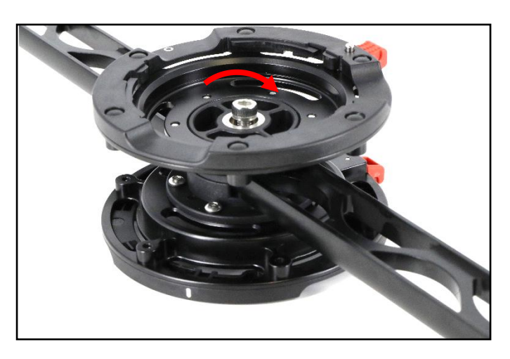
Align the two bayonet holders, and secure it by tightening the screw with an allen key.