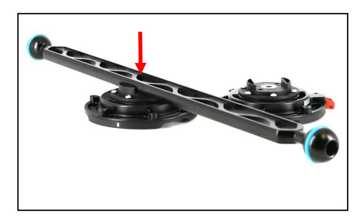
Place the arm to the bayonet mounting base as shown.